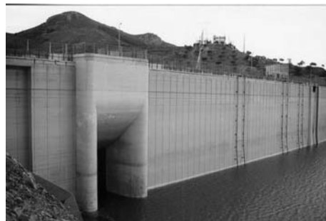
Figures 2 & 3: Pracana 65 m high buttress dam in Portugal, affected by AAR, was waterproofed with an exposed PVC liner in 1992. In 2003 (at right), the owner reports “the concrete dam waterproofing may be assumed to contribute for the reduction of the swelling process”.