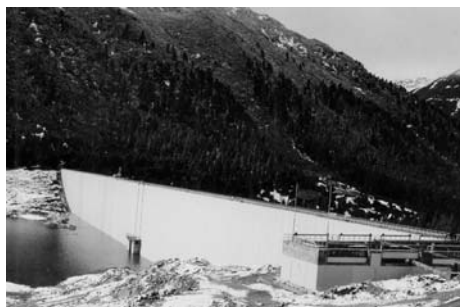
Figures 4 & 5: Beli Iskar 49.7 m high masonry dam, Bulgaria 2002. The exposed PVC geocomposite is installed on an anti-puncture geotextile. The dam is at 1878 m of altitude, ice thickness up to 0.60 m.

The PVC geocomposite is anchored at the perimeter with the same watertight seal, made by compression, adopted on concrete dams. In order to provide an even surface which is crucial to achieve watertightness, the masonry was regularized in the areas of the seals with a gunite layer.