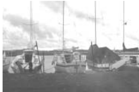
Ashburton sailing - Club day