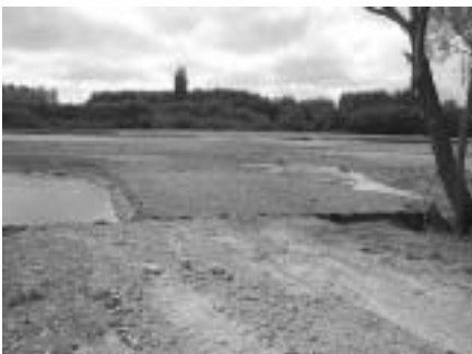
Intake during normal flow

The lake was completed on 15 th December 2001 and during Christmas and New Year 2001 the mean annual flood in the Ashburton River occurred. The lake was quickly filled by the floodwater. It transpired that this was the best thing that could happen for the lake, for a week floodwaters were taken, which successfully helped seal the lake floor with natural flood sediments.