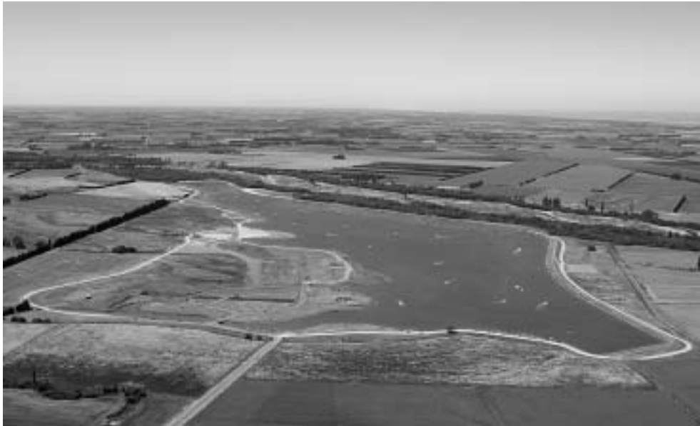
Lake Hood – Typical weekend

The lake was officially opened on 28 April 2002. The high level of attendance reflected the support from the community.