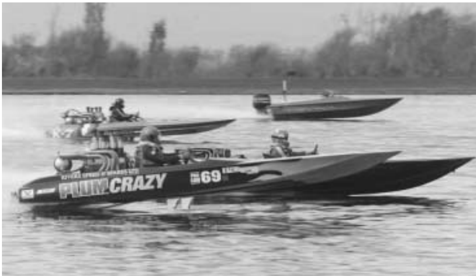
New Zealand Power Boat National Championships April 2003

The community is affected each time there is a significant event held on the lake. Events such as the New Zealand Long Distance Canoe Meet or the New Zealand Powerboat Racing National Championships impact right throughout the community. Such businesses as petrol stations, hotels, motels, company groups, restaurants, and supermarkets are all positively affected.