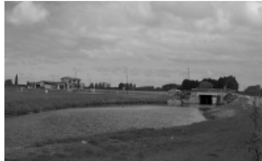
New residential houses under construction

The completion of the first houses has resulted in a dramatic increase in the sale of remaining sections. Now that families are residing at Lake Hood there is already the feel of a community. In time these local residents will enjoy a rural lifestyle with a water front aspect.