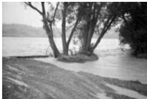
Intake during flood flow Jan 02