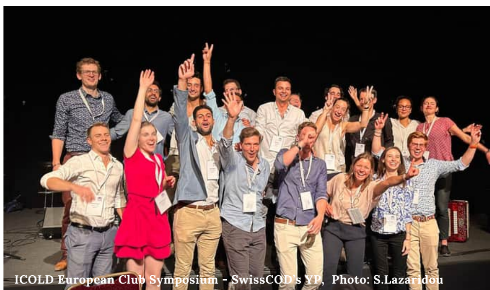
ICOLD European Club Symposium - SwissCOD's YP

The preparation and distribution of the 2024 Swiss Dams calendar took place in the second half of the year. The calendar was only sent to 12 National Dam Committees and to ICOLD (after feedback was received from various committees reporting difficult delivery conditions).