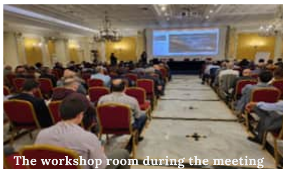
The workshop room during the meeting

The presentations (in Italian) of the event can be downloaded from the ITCOLD website. Clicca qui