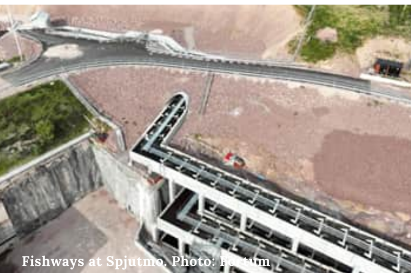
Fishways at Spjutmo.

Plans for 2024: Two issues of SwedCOLD Newsletter.