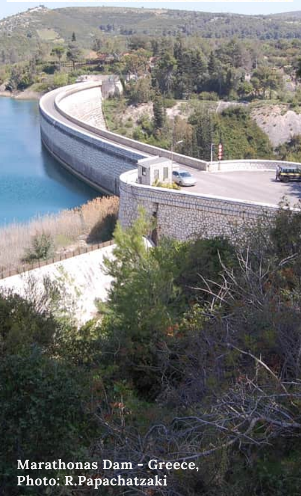
Marathonas Dam – Greece