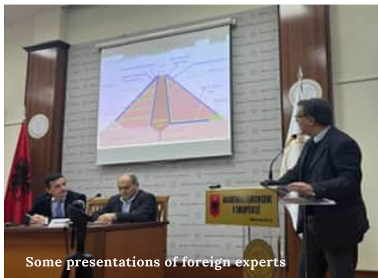
Some presentations of foreign experts