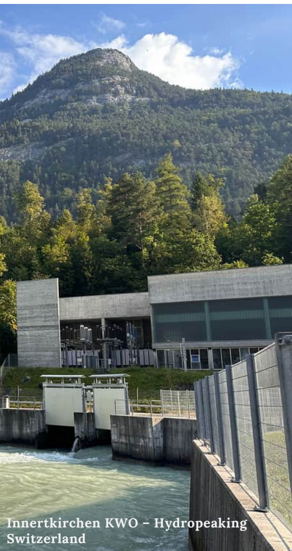
Innertkirchen KWO – Hydropeaking Switzerland