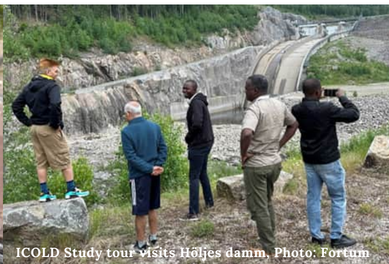
ICOLD Study tour visits Höljes damm.