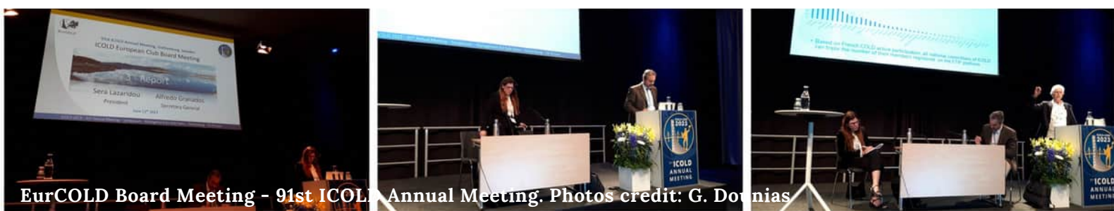
EurCOLD Board Meeting - 91st ICOLD Annual Meeting.