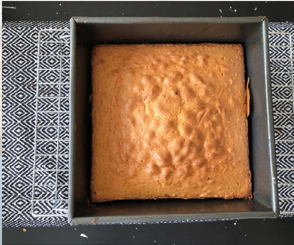
Make the Victoria sponge cake