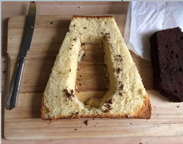
Cut out for the clay core