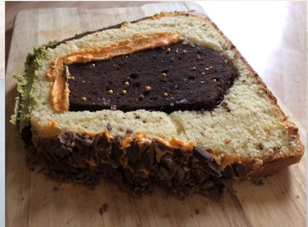
Add chocolate chunks to left for stone pitching