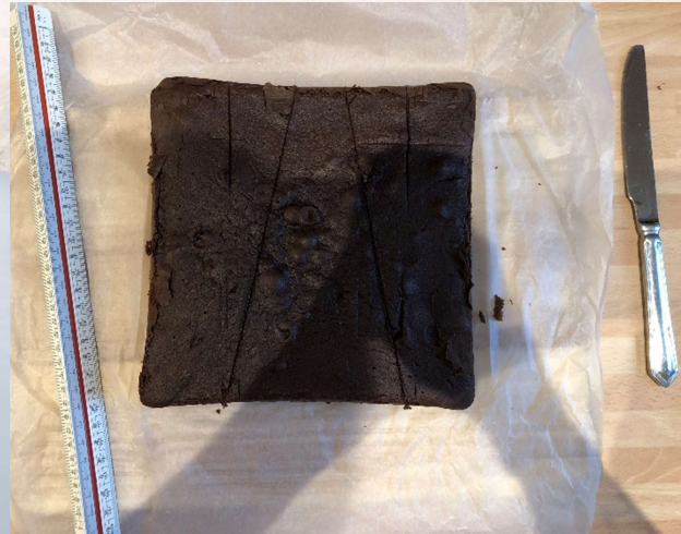
Make the chocolate cake