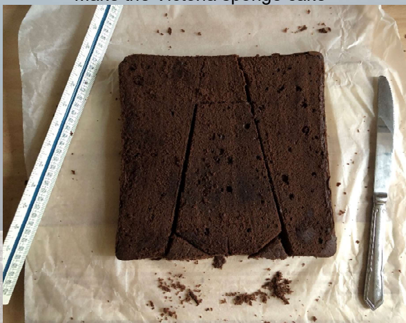
Mark out the chocolate 'clay core' cake