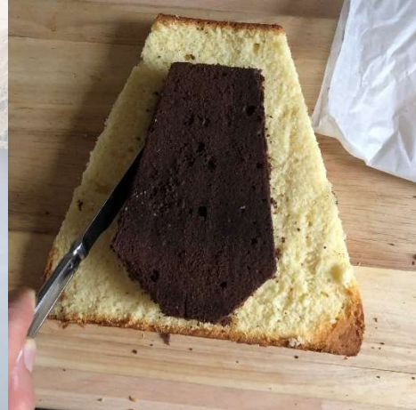
Cut round the clay core