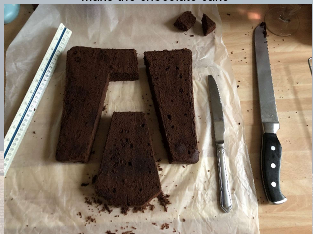
Cut out the chocolate 'clay core' cake