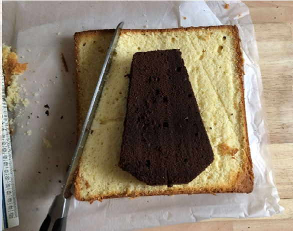
Place the clay core on the sponge cake and cut the embankment slopes