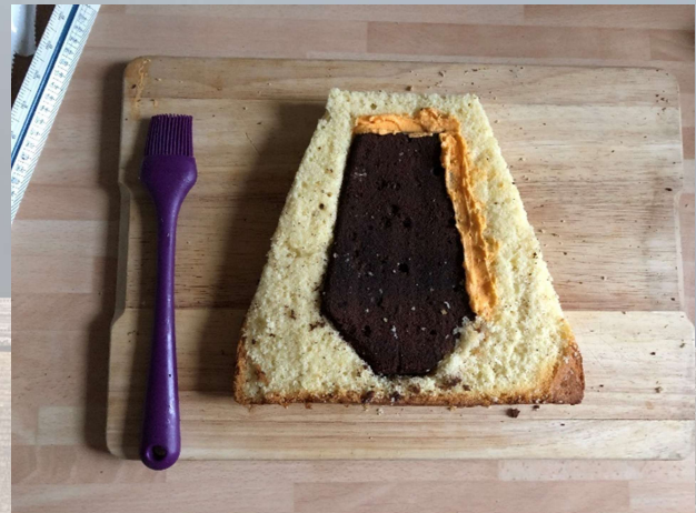
Place the lay core in the cut out section and add icing for filter drainage