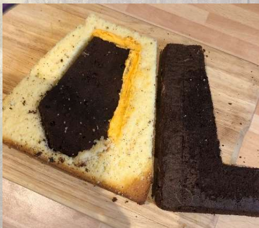
Use left-over cake to add topsoil