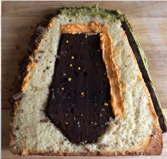
Add green icing to right side for the grass