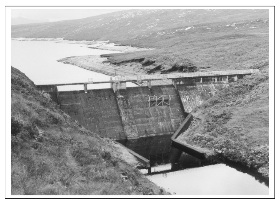
Figure 1: General View of Loch Dubh Dam