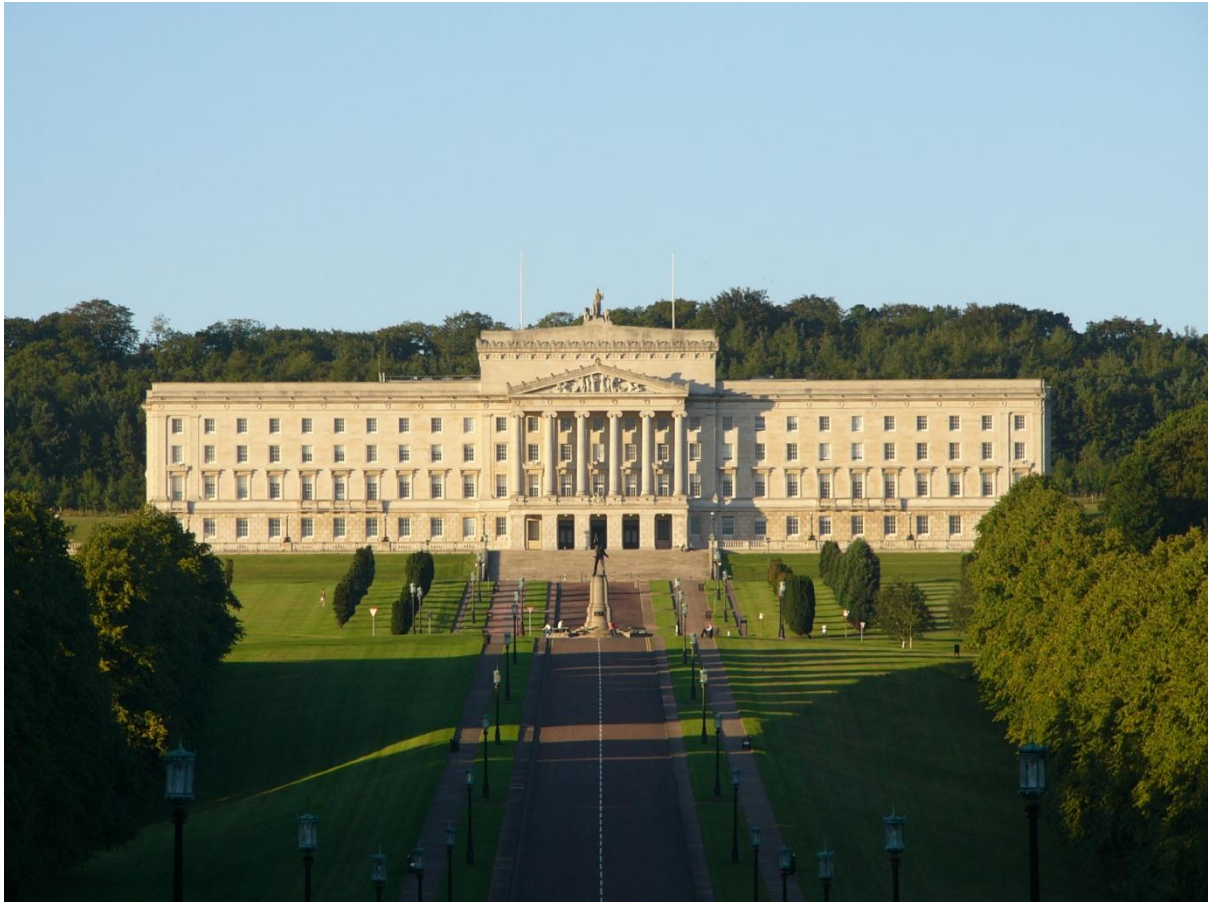
Stormont Castle – Parliament Buildings

The Parliament Buildings, commonly known as Stormont because of their location in the Stormont area of Belfast, are the seat of the Northern Ireland Assembly and the Northern Ireland Executive. After the shelving of plans to build a "Ministerial Building", the headquarters of government was in effect Stormont Castle, a baronial castellated house in the grounds and which was originally meant to have been demolished to make way for the "Ministerial Building". Stormont Castle served as the official residence of the Prime Minister of Northern Ireland and was the meeting place for the Northern Ireland cabinet.