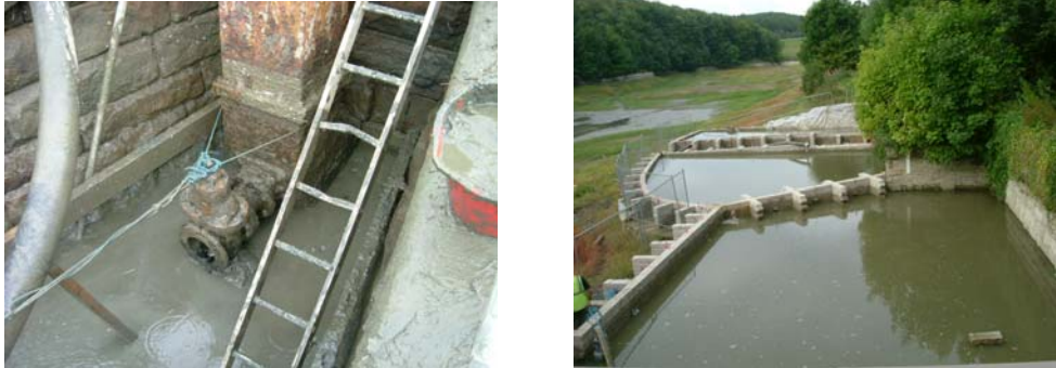
Figure 9 and 10 : Lower Linacre , Existing Guard Valve and Lagoons

The lining work itself underwent a feasibility review. At this stage early discussions with a specialist contractor and NWH assessed very quickly that installation of the lining would be difficult due to access problems to the location of the scour pipework. There were no access roads or paths on which plant could be taken and moving any equipment would probably have to be done manually.