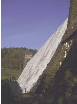
Figure 1 : Howden's central crest weir

central crest weir (ref Figure 1 : Howden's central crest weir) , into the head waters of Derwent Reservoir. A similar weir structure on Derwent Dam discharges flood water from Derwent Reservoir into the headwaters of Ladybower Reservoir. The three reservoirs are used as a source of raw water for Bamford Water Treatment Works, which serves a population of about a million customers throughout Derbyshire, Nottinghamshire and Leicestershire.