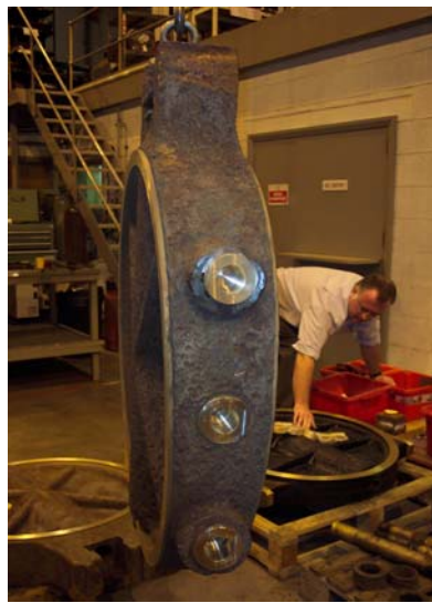
Figure 5 : View showing the wedge and guide bushes

At feasibility stage it was considered that removal of the scour valves would be difficult as there were no existing provisions in the valve chambers for removal. In addition access was very difficult as there were no direct routes that plant could travel to the valve chambers. However, Blackhall Engineering designed and constructed temporary gantries to allow safe removal and the work proceeded very efficiently.