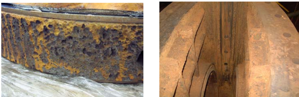
Figures 3 and 4: Wedge Cavitation and Scored Channel Guides

In July 2005 Norwest Holst commenced construction work with subcontractor Blackhall Engineering. A comprehensive valve condition report was issued by NWH for each valve as it was dismantled. The pre-tender assessment of proposed works were found to be a good estimate and refurbishment was initiated at Blackhall Engineering's factory. Typical valve condition found following stripping can be seen in Figures 3 and 4 : wedge cavitation and scored channel guides. Work during refurbishment can be seen in Figure 5 : view showing the wedge and guide brushes