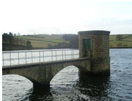
Figures 8 : Upper Linacre valve tower

The provision of a scour guard valve at the Upper Reservoir was requested by the Inspecting Engineer as there was no 'secondary' valve on the scour outlet.