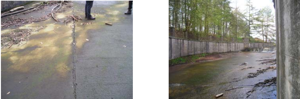
Figure 6 and 7 : Typical floor joints prior to repair and spillway channel