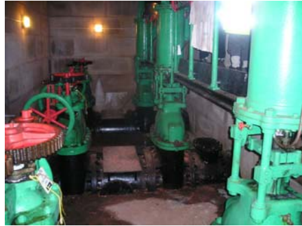
Figure 2 : Derwent Valves

The scour valves are similar to those at Howden. Hydraulic head to operate the valve actuators is provided by means of a 2 inch diameter asbestos cement and uPVC pipeline from Walkers Clough, a small reservoir situated high up on the eastern hillside overlooking the reservoir.